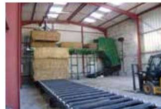
Grass Cutter and Feeding System for cutting and feeding switch grasses, miscanthus, straw, and similar into boilers.

Skanden offers different types of storage bins and feeding mechanisms, to accommodate pellets, wood chips, switch grasses, waste products, and other biomass. We offer a hydraulic live floor fuel discharge systems for wood chips. We have equipment that reliably cuts grasses and straw and feeds it into augers. Our pellet silos can be custom painted to match adjacent architecture.