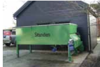
Hydraulically unloaded Storage Systems for wood chips

A Skanden Heating System is not just the most advanced boiler available. It is a total customized solution, comprised of fuel storage and feeding mechanisms, biomass boilers, exhaust system filtration and chimneys.